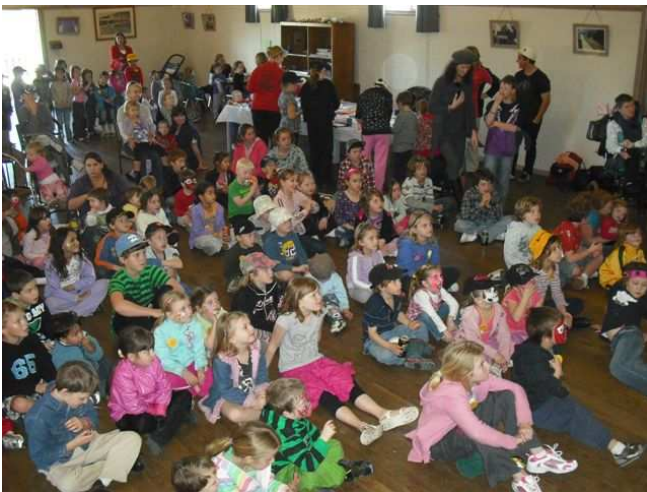
ENJOYING THE SHOW