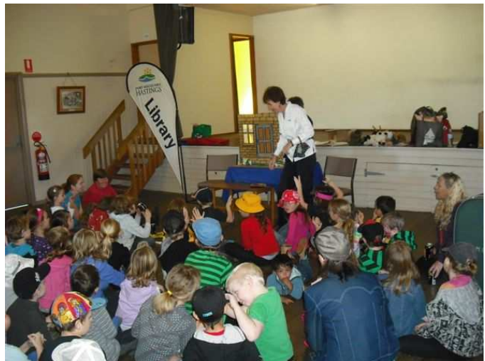
Port Macquarie Hastings Library getting ready for the puppet show